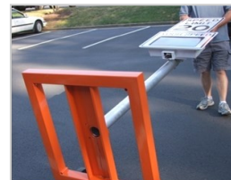
One-person operation to tilt and roll to a new location