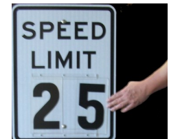
Interchangeable SPEED LIMIT display