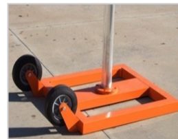
Angled wheels ensure stability and easy-tilt when ready to move